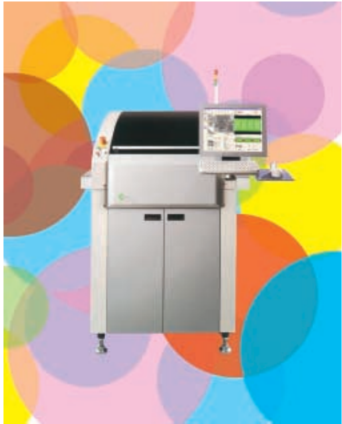
Koh Young KY-3030 VAL 3D Solder Paste Inspection System 三維錫漿檢測儀