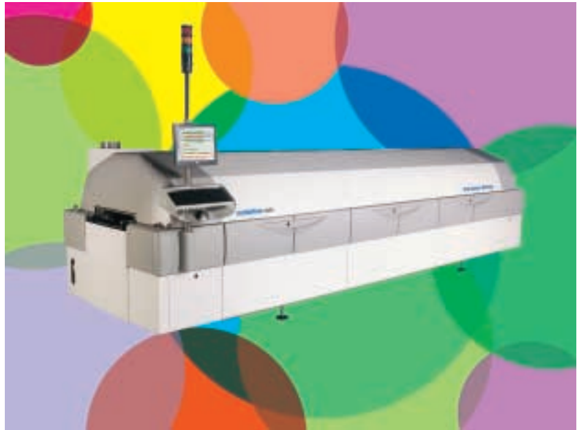
Vitronics Soltec MR933 Lead Free Reflow Soldering Oven 無鉛回流焊接爐