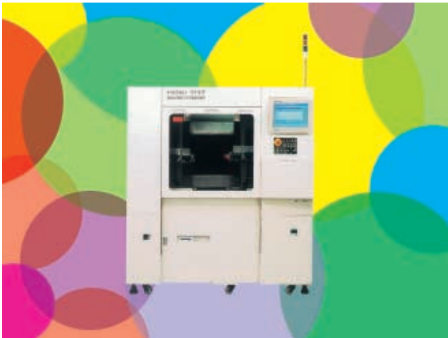
Flying Probe Testing System Dual-Sided Bare Board Tester 1117 飛針測試系統：雙面光板測試機