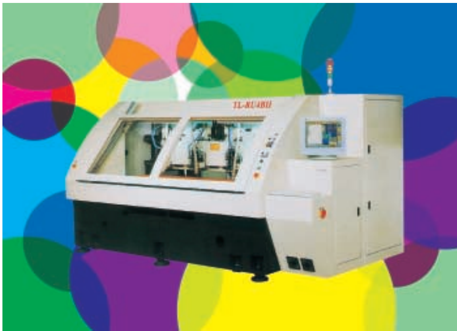
TL-RU4B II PCB Router 印刷電路板成型機