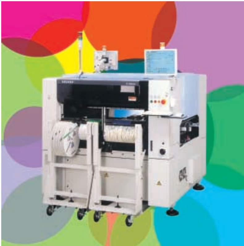
Yamaha YG100 Modular High Precision Mounter 模塊式高精度貼片機