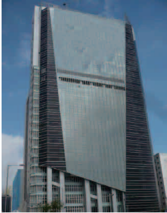
Corporate office 17/F 企業辦事處十七樓