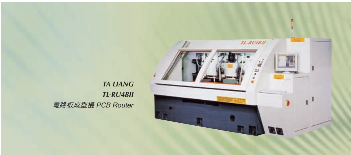
TA LIANG TL-RU4BII 電路板成型機 PCB Router