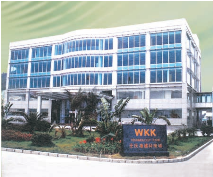
Administrative Building 行政大樓