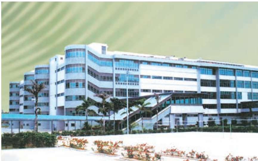
Factory Outlook 廠房外貌