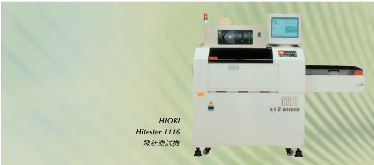
HIOKI Hitester 1116 飛針測試機