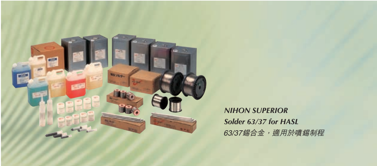
NIHON SUPERIOR Solder 63/37 for HASL 63/37錫合金，適用於噴錫制程